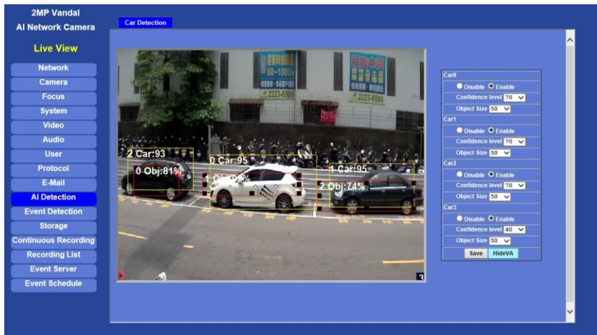
< Car detection and DO control >